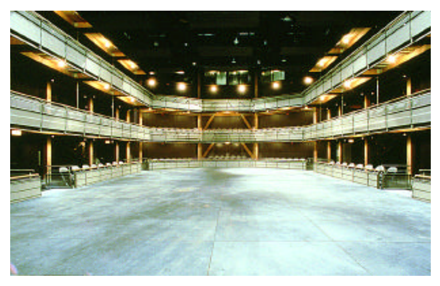
The Owen Bruner Goodman Theatre is a flexible, 400-seat courtyard theater with sound coverage from 10 MacPherson IS12 full-range loudspeakers.

The Goodman Theatre houses two principal theaters: The 856-seat proscenium stage Albert Ivar Goodman Theatre anchors the south end of the complex. while the Owen Bruner Goodman Theatre is on the north end. Modeled after London's famed Cottesloe Theatre at the Royal National Theatre, the Owen features three levels of courtyard seating surrounding the stage. Composed of flexible modules, the stage can be rearranged to create a variety of configurations including an end stage, thrust, arena stage or runway stage. Seating capacity ranges from 335 to 467, depending on the configuration.